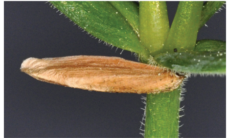
Coleophora lithargyrinella