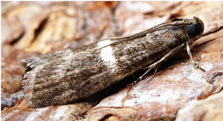
Elegia similella was a new addition to the county list in June